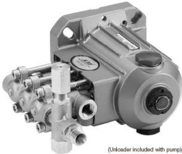
(Unloader included with pump)